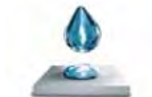
PIGMENT INK (traditional technologies)